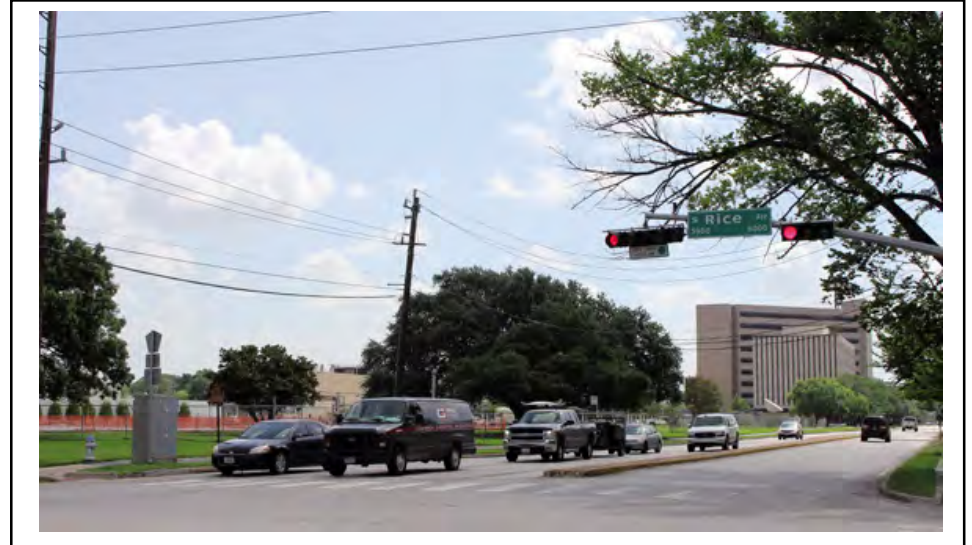
Chevron has announced plans to move its 900 employees at the Bellaire office to their downtown Houston location. They plan to put the nearly 30-acre campus on the market in late 2016.