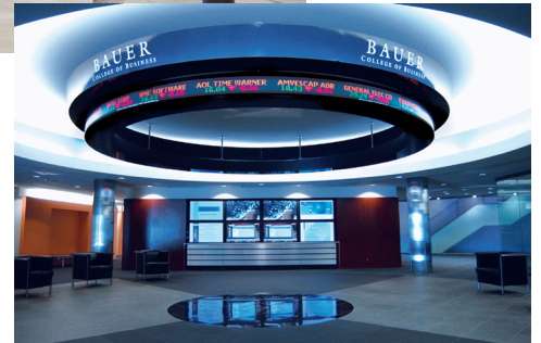
Ticker area and video wall