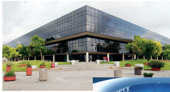
Front entrance to Melcher Hall and the Bauer College of Business on the University of Houston central campus