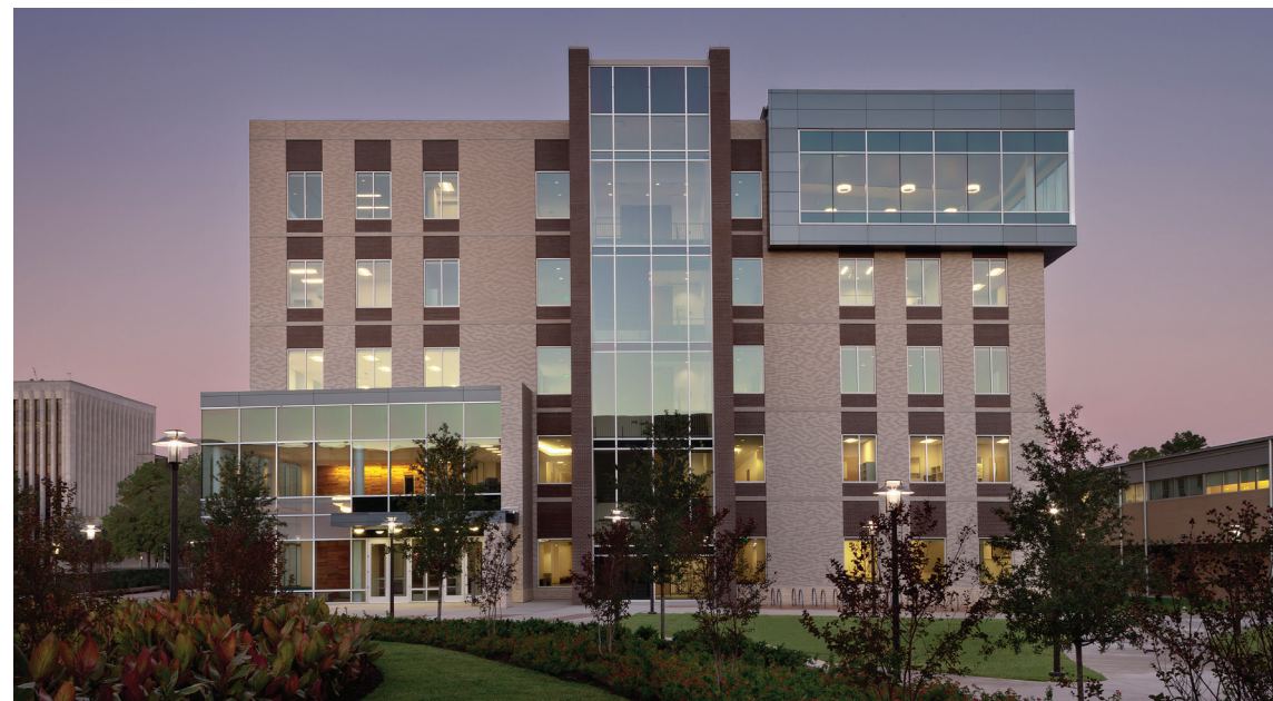
University Classroom and Business Building, University of Houston