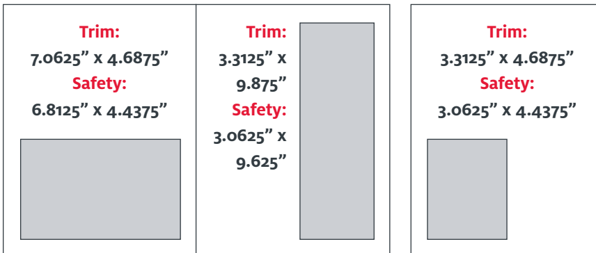
HALF PAGE HORIZONTAL