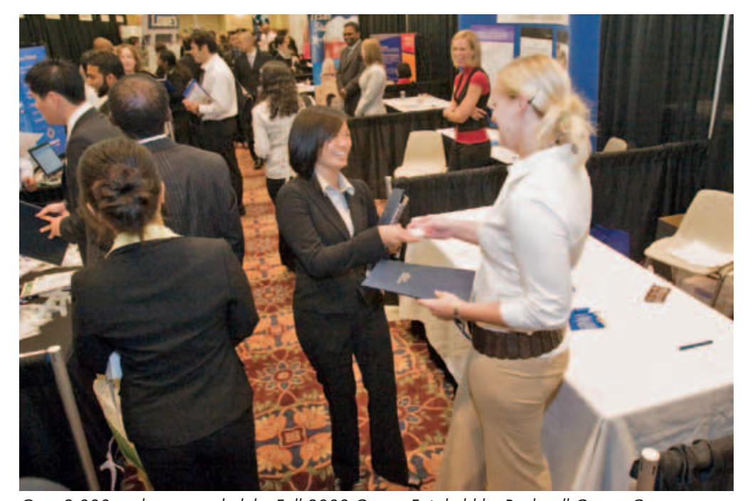
Over 2,000 students attended the Fall 2008 Career Fair held by Rockwell Career Center.

Thousands of UH Bauer College students looking for internships and preparing for the job market after graduation met with more than 150 recruiters from the area's leading businesses at the Fall 2008 Career Fair hosted by Rockwell Career Center.