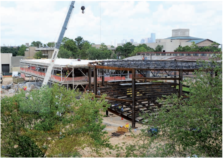
Construction of Cemo Hall has gone vertical, with steel frames erected for the building and lecture hall.

Cemo will house the Rockwell Career Center (RCC),