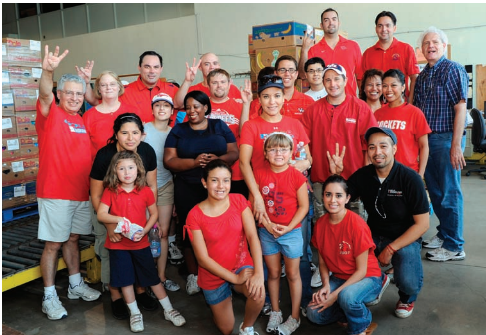
Volunteering was a family affair at the Bauer College Alumni Association's first-ever Alumni Day of Service, held in June at the Houston Food Bank.

The alumni association chose the Houston Food Bank as the recipient of its first Day of Service for many reasons, including its family friendly atmosphere, which allowed alumni to bring children as young as eight to volunteer alongside