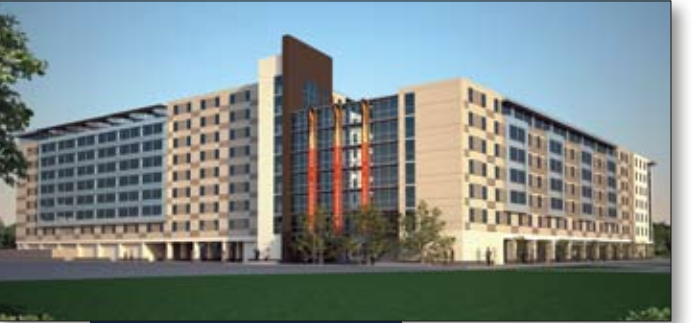
An architect's rendering of Calhoun Lofts as seen from site of future Cemo Hall.

Best to you as we enter our fall 2007 semester,