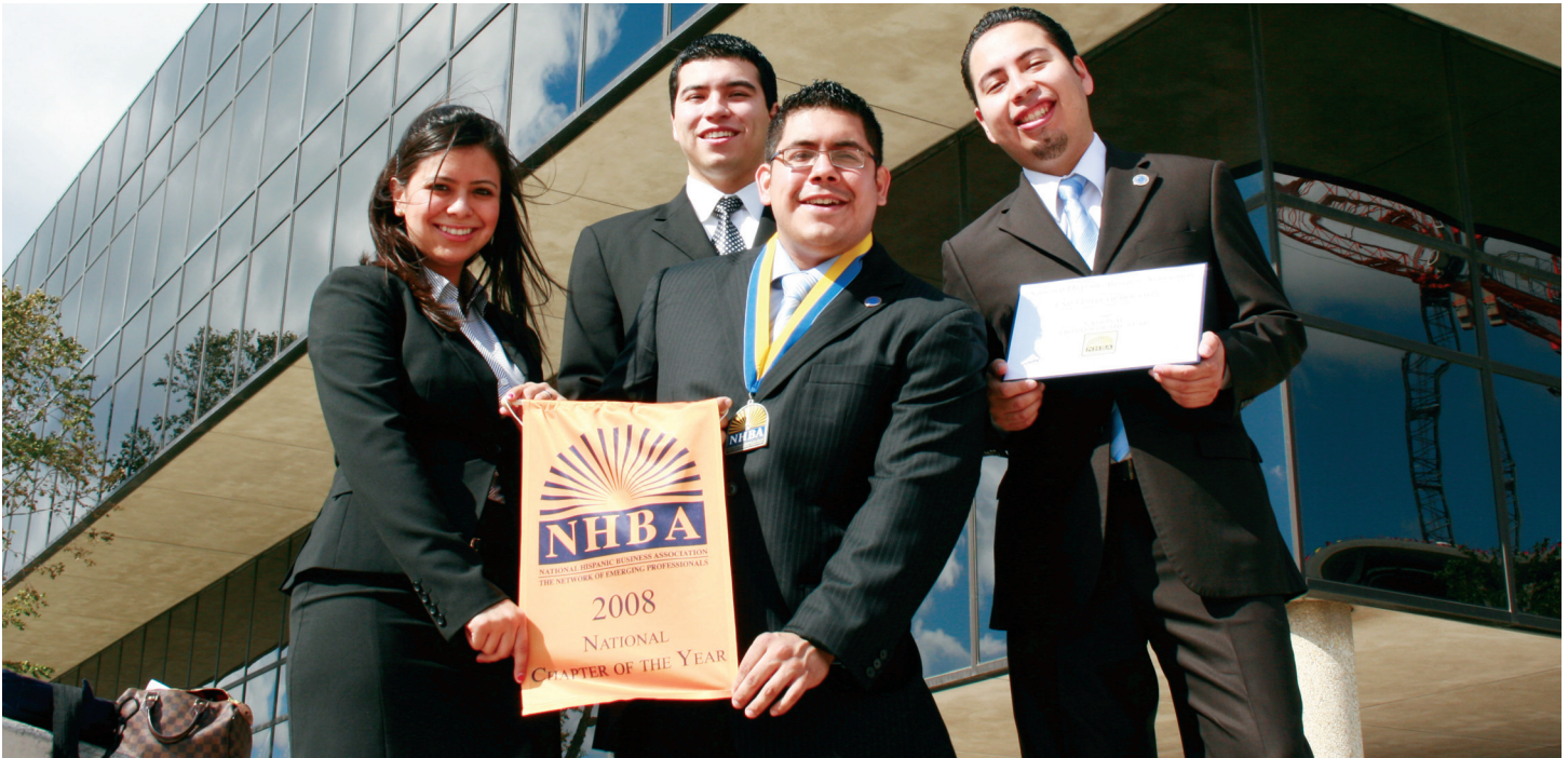
The Hispanic Business Student Association chapter at Bauer College was named Chapter of the Year at the annual National Hispanic Business Association Leadership Conference .